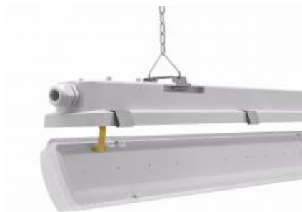
system zwieszania klosza / suspension system of the diffuser / hängende Diffusor