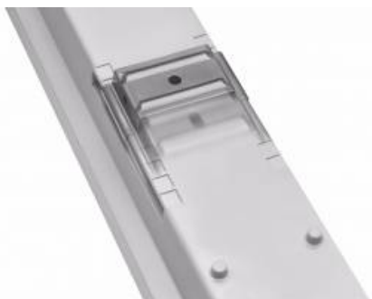
regulowane uchwyty / adjustable handles / einstellbare Halterungen