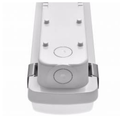
wybór miejsca zasilania / choosing a place of power supply / Stromversorgungsanschluss von mehreren Seite möglich