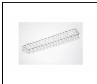
TYTAN LED, ATLAS LED - protective grid 1432mm (907920)