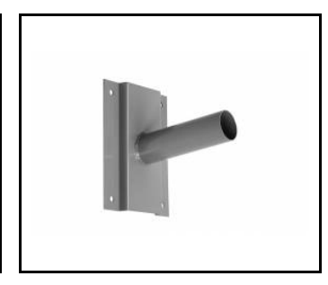
mounting grip 76mm (UL00141)